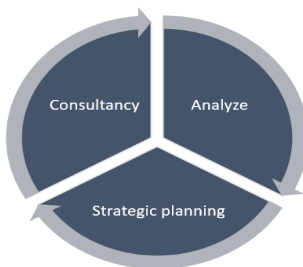
Fig. no. 2 The role of accountants in a digitalized organization