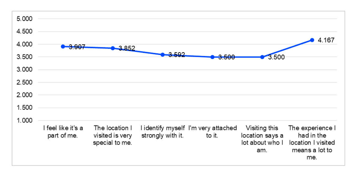
Fig. no. 2 The quality of the consumer experience in the tourist location specific to the rural environment

The answers also indicate a nuanced degree of attachment from a part of consumers with a specific emotional involvement, which can be also related with the pressure caused by the pandemic anxiety. Tourists pay attention to the need of identification between the destination and their personality as a clue for their need of self-confirmation for the choices that they made.