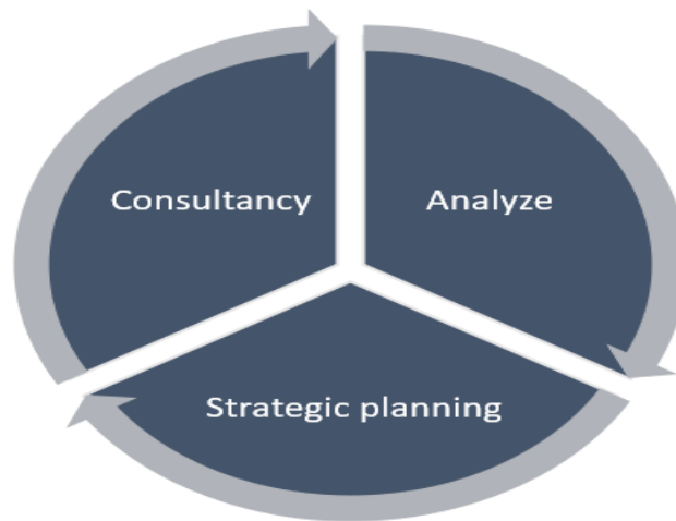
Fig. no. 2. The role of accountants in a digitalized organization

Following the digitalization process of an accounting organization, its employees will be able to carry out other activities than the usual ones such as (fig. no. 2):